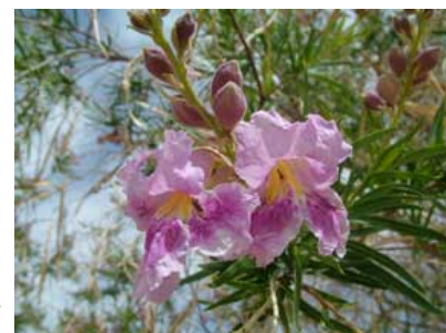
Everything from Palo Verde and Mesquite trees, to Desert Birds of Paradise and Aloe Vera made it to the HVCC table at the YMIA Country Faire.