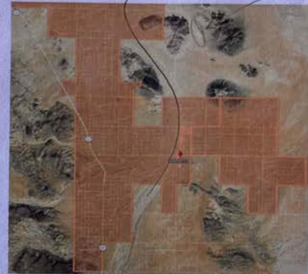
Bighorn-Desert View Water Agency